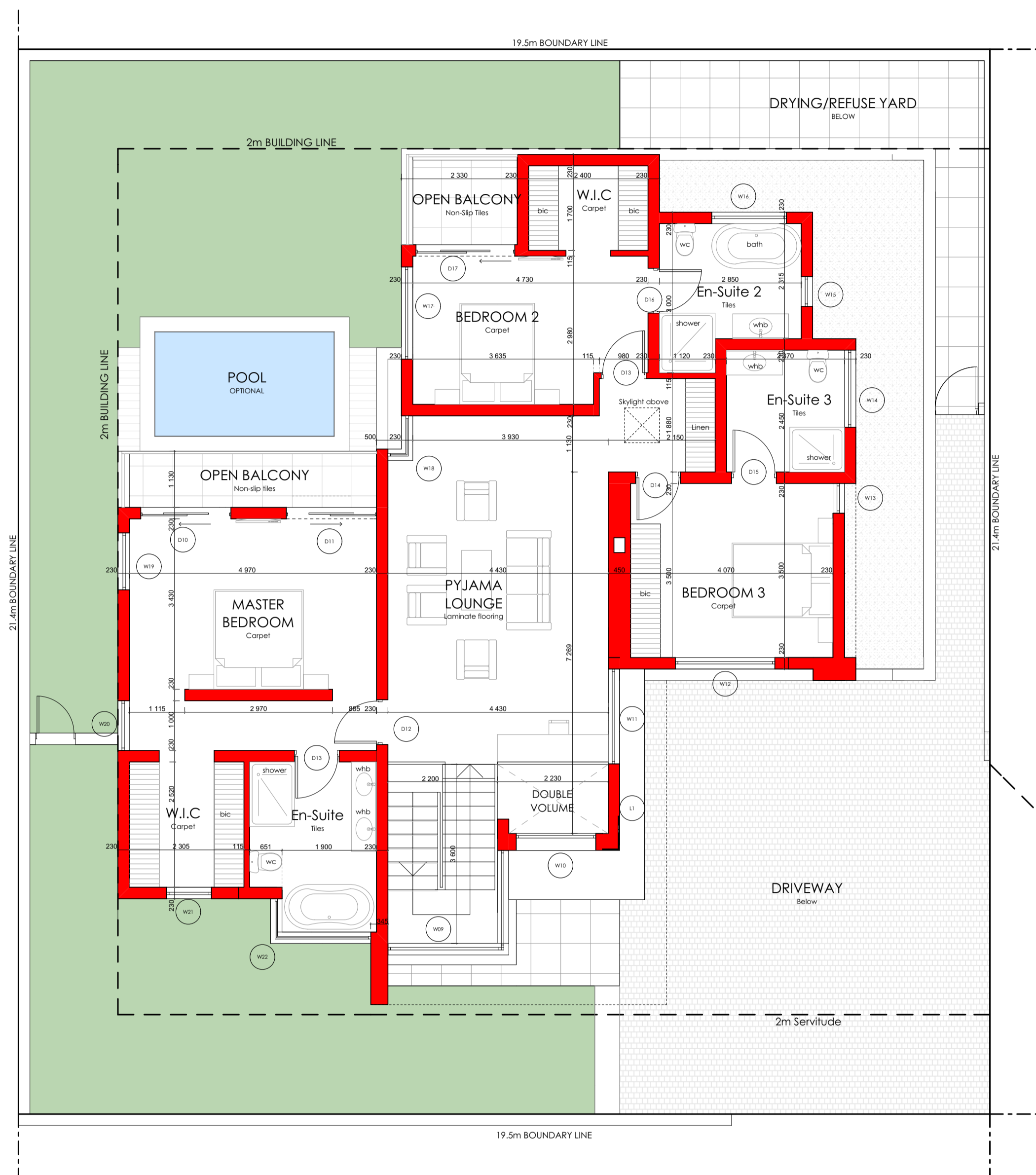
N PORTION 8 UNIT TYPE C PROPOSED FIRST FLOOR LAYOUT SCALE 1:75 @ A1